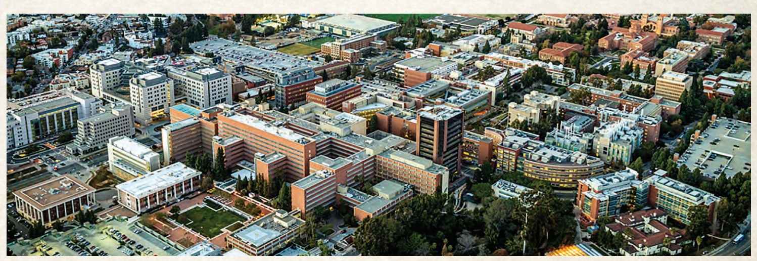
Aerial View of the UCLA Medical Center

The FDA has issued a concept paper that classifies commercial support of scientific and educational programs as promotional unless it can be affirmed that the program is "truly independent" and free of commercial influence. In addition to independence, the FDA requires that non-promotional, commercially supported education be objective, balanced, and scientifically rigorous. The policy further states that all potential conflicts of interest of the CME staff and faculty be fully disclosed to the program's participants. In addition, Accreditation Council for Continuing Medical Education policy mandates that the sponsor adequately manage all identified potential conflicts of interest prior to the program. We at UCLA fully endorse the letter and spirit of these concepts.